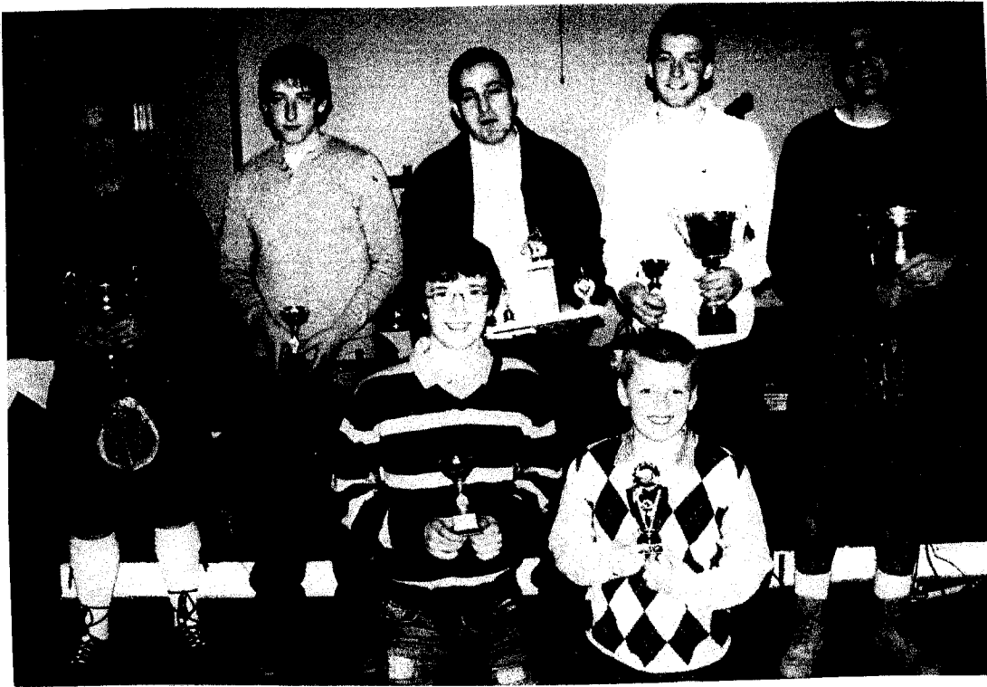
Dunfermline Motorcycle Club Champions