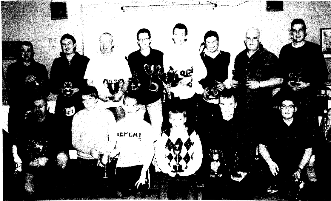
Lanarkshire Motorcycle Club Champions